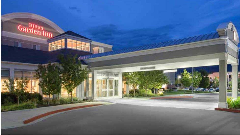
Hilton Garden Inn Salt Lake City/Layton and Davis Conference Center complex